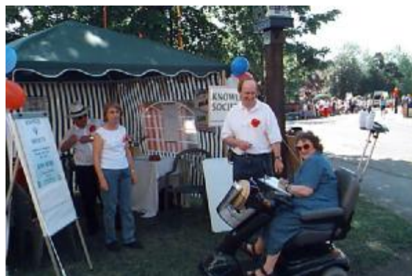
The gazebo at the Queen's Golden Jubilee and the Society's 40th celebrations in 2002

Last year's event combined guided tours of the church building and the church tower (the Heritage Open Day element). Refreshments will be served in the Guild House and we plan to erect the Society's bright green striped gazebo on the village green. We hope to assemble several other things of interest in and around the green, including some activities that will interest young families. This proved to be a highly successful combination last year and many new members were recruited to the Society.