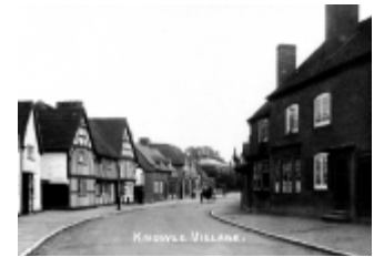
High Street in 1940