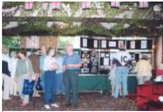
The exhibition at the Royal British Legion D Day event

'AMERICAN INTERLUDE' Preparing for D Day in Knowle An American Army Medical Unit in Knowle (1944) Knowle Men and Women in the Armed Services · Fire Fighting · Air Raids · The Home Guard · Evacuees · Dig for Victory · First Aid Rationing · Fund Raising · Bakelite Ltd. Research Laboratory In the Local History Centre showcases Chester House Library (1st Floor) 7 th June 2004 - 31 st August 2004 Open During Normal Library Hours