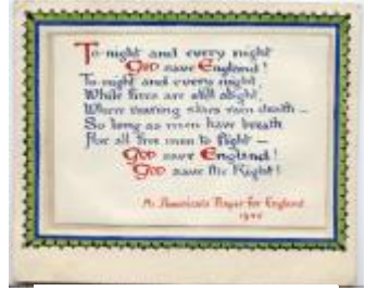
An American's Prayer for England 1940 (see below)

Those of you who went to the British Legion's Open Day on June 5th will have seen the Local History Centre display called American Interlude , which covers the six months in 1944 when an American Army Medical Unit was stationed in Knowle preparing for D-Day. Also included are photographs of some of the local people who served their country in the armed forces and others of relevant places in the village. The display is now in the show cases at Chester House, where it will remain until replaced by the Autumn display in September. We were also showing our Local History Centre stall, first designed for Local History Week at Chester House last October. Nearly new for the occasion was a leaflet entitled A Walk Round Wartime Knowle , which is a self-guided tour round places associated with the Second World War. It is still available at the Local History Centre for the bargain price of 50p. We did produce this some years ago, but home computers have come a long way since, so it is now in the popular one third A4 format with a photograph on the front. Absolutely new was a slide show of old postcards produced by Geoffrey Dean. Those there on 5th June will have realised that we have acquired the use of a laptop computer (Yours Truly has finally replaced an ancient Apricot). We hope to produce more of these rolling slide shows, but it is early days - new operating system, new software and a still-to-be acquired new scanner.