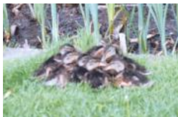
... seven ugly ducklings