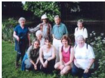
Wildflower Walk - nine beauties and photographer meet ...