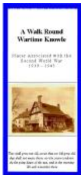
A Walk Round Wartime Knowle