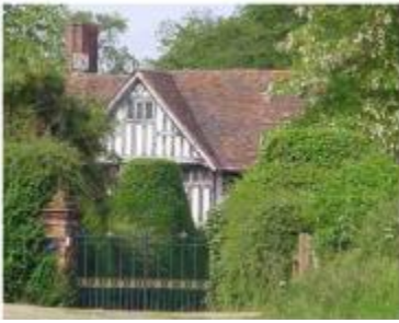
The Dial House—Heronfield