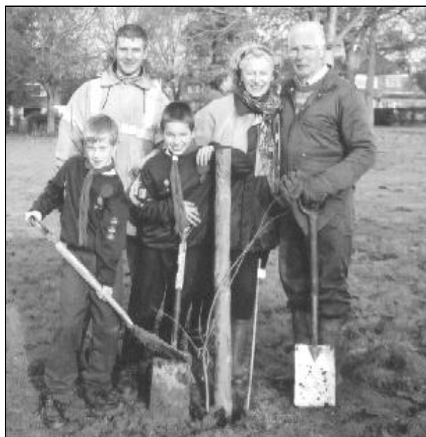
Planting the 'Cloned' Elm in Jobs Close Park. November 24th, 2000