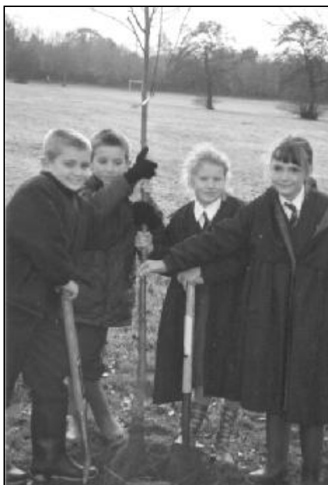
Members of Knowle Junior School's Garden Club planting their own dedicated trees in Jobs Close Park on November 24th 2000.