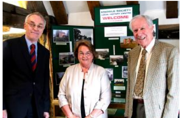
An eyeful of chairmen and a president at the LHC