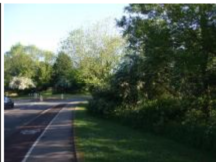
Wychwood Avenue roundabout from Knowle—by Ardenvale Road

In the April newsletter I made reference to the committee's approach to enhancing the green environment of Knowle. Whilst we will monitor any changes and respond to matters which come to our attention, we would remind readers that we propose to organize a rolling programme to review all open spaces and to see what can be done to improve them. We said that we propose to start with the Warwick Road roundabout at the junction with Wychwood Avenue and Langfield Road. This will include the green space in the middle of the roundabout and the areas around the sides.