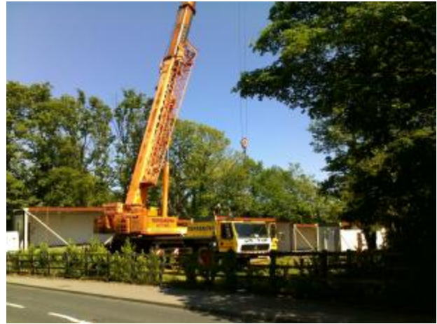
Arden School demolishes an eyesore after growing pressure