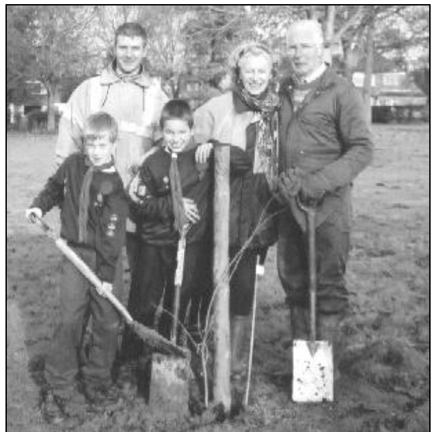
Planting the 'Cloned' Elm in Jobs Close Park. November 24th, 2000